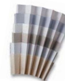
Available In ALMOND, PEARL, MAGNOLIA, GARDENIA, WINTER AND VANILLA