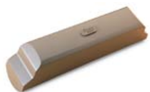
Available In BRONZE OR WHITE